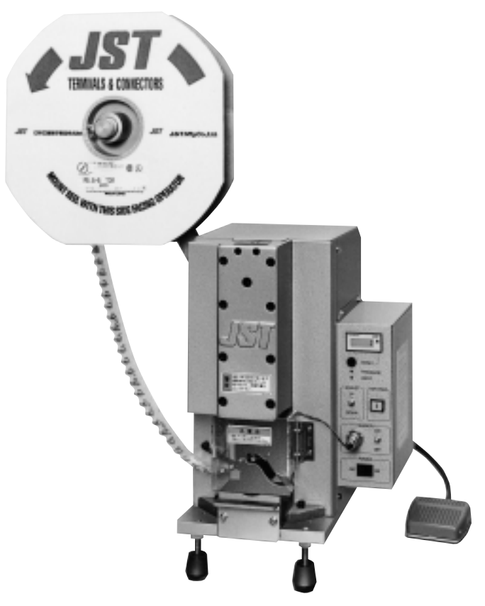
•Touch-sensor-system cannot be applied to some of the terminals/splices.